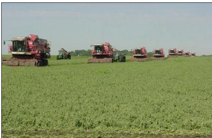
Midwest Food Processors Association

Note: Sum of impacts may not equal total impact due to rounding.