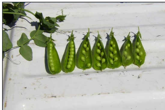
WI Potato and Vegetable Growers Association