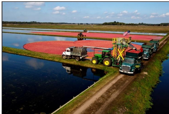
WI State Cranberry Growers Association