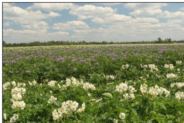
WI Potato and Vegetable Growers Association

Production and processing of specialty crops in Wisconsin are important to both state and national agricultural and manufacturing industries. Wisconsin ranks 7 th among US states for farmgate vegetable sales and 8 th for farmgate fruit and tree nut sales. While a portion of these sales enter fresh markets (grocery stores, restaurants, farmers markets, etc.), a significant amount of Wisconsin farmgate sales go to processors for freezing, canning, drying and pickling. As a result, Wisconsin ranks 2 nd among US states for both harvested acreage and total production of processing vegetables and 3 rd for production value. Key processing crops in Wisconsin include potatoes, sweet corn, green beans, green peas, carrots, cucumbers, and onions, with