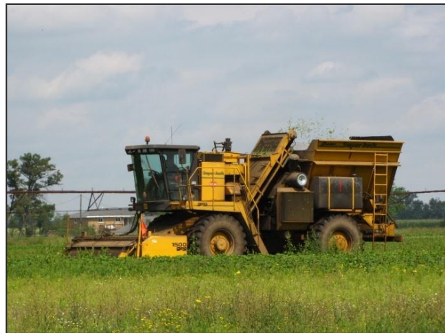
WI Potato and Vegetable Growers Association