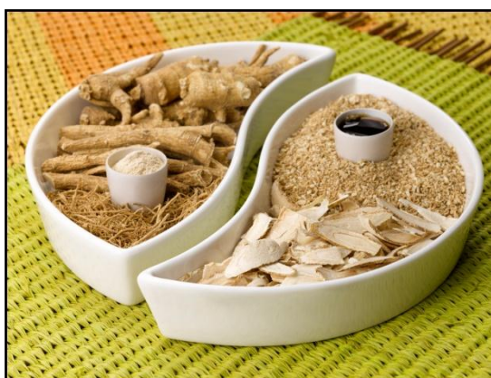
Ginseng Board of WI