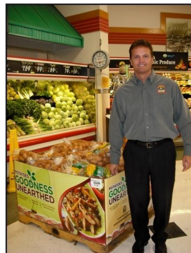
WI Potato and Vegetable Growers Association