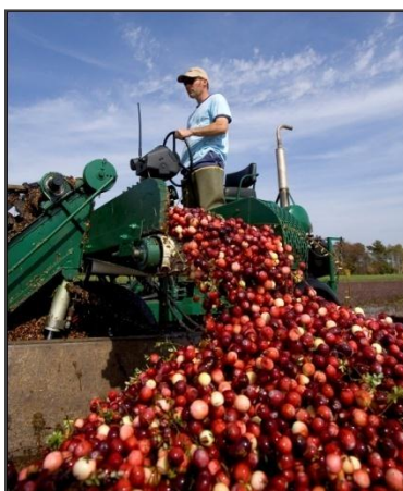
WI State Cranberry Growers Association

Note: Sum of impacts may not equal total impact due to rounding.