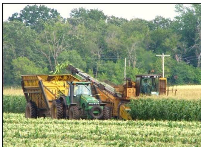
WI Potato and Vegetable Growers Association

Note: Sum of impacts may not equal total impact due to rounding.