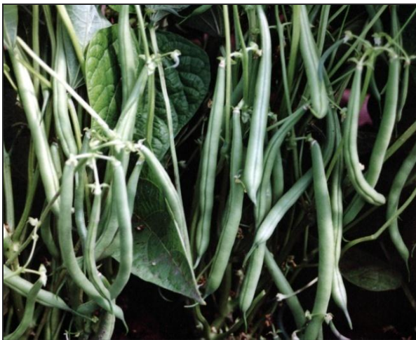
WI Potato and Vegetable Growers Association

Note: Sum of impacts may not equal total impact due to rounding.