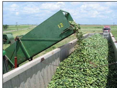
WI Potato and Vegetable Growers Association