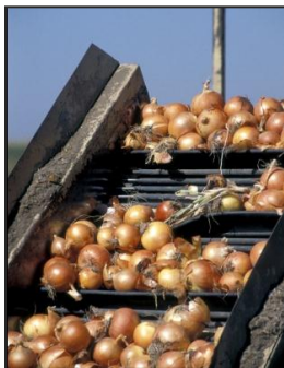
WI Potato and Vegetable Growers Association

1 Production estimates based on 2006-2008 average farmgate values. Note: Sum of impacts may not equal total impact due to rounding.