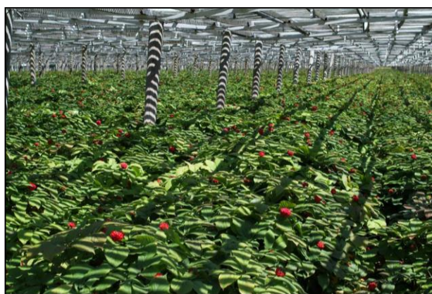
Ginseng Board of WI

Note: Sum of impacts may not equal total impact due to rounding.