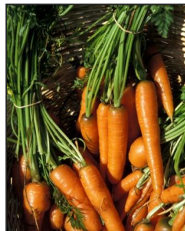
WI Potato and Vegetable Growers Association