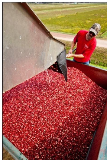
WI State Cranberry Growers Association