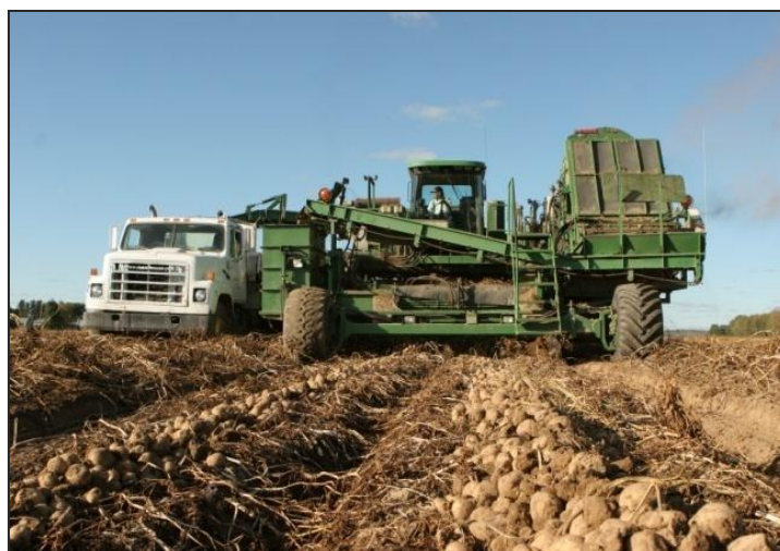
WI Potato and Vegetable Growers Association

Note: Sum of impacts may not equal total impact due to rounding.