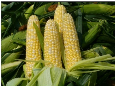
Midwest Food Processors Association